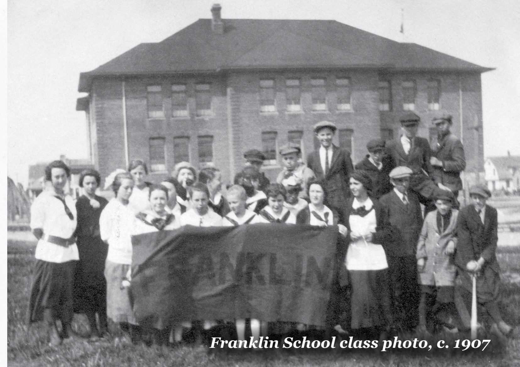
Franklin School class photo, c. 1907