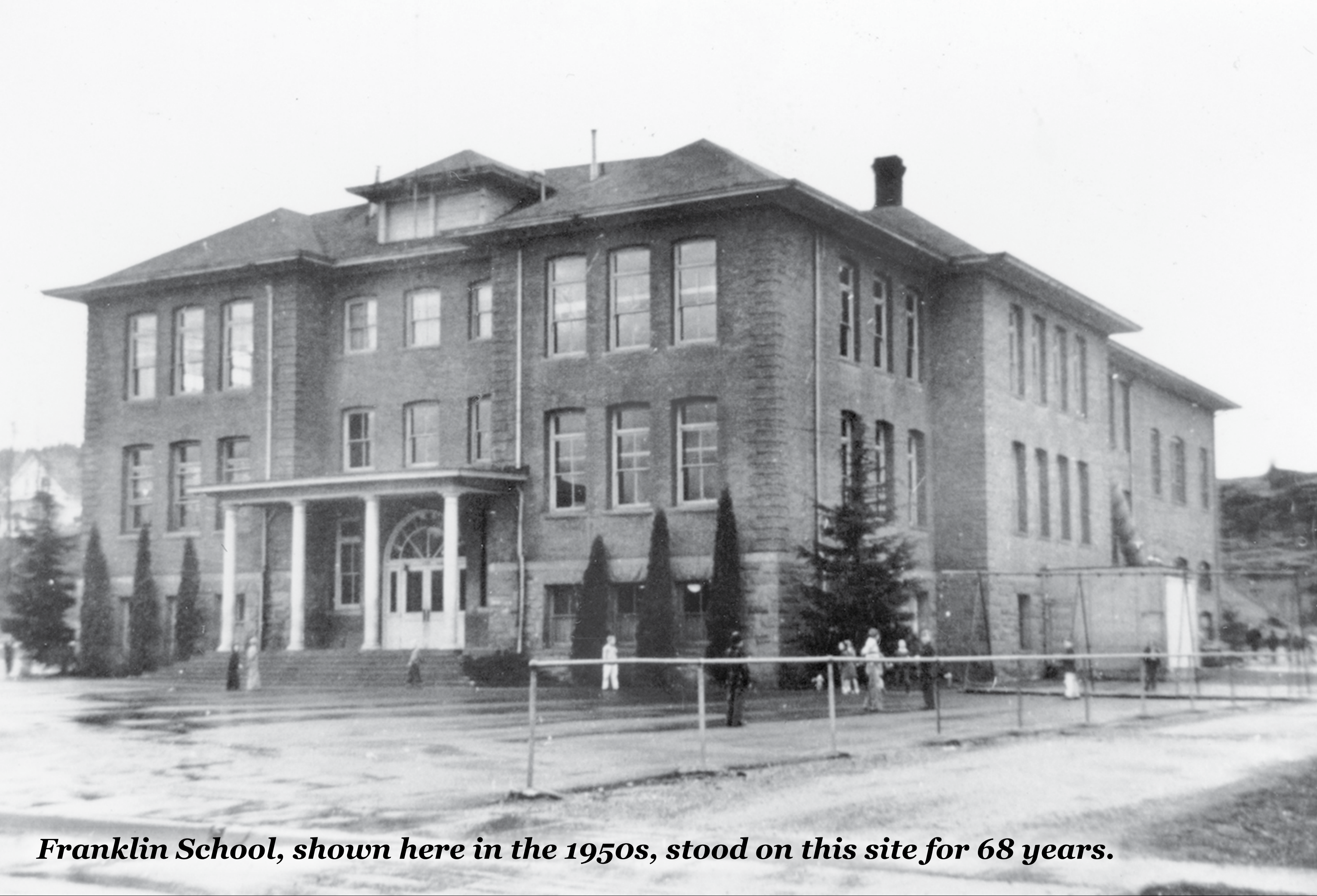
Franklin School, shown here in the 1950s, stood on this site for 68 years.