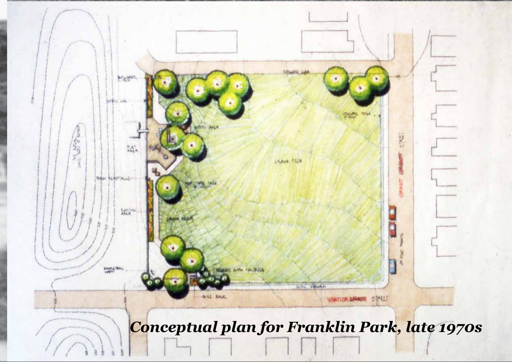
Conceptual plan for Franklin Park, late 1970s